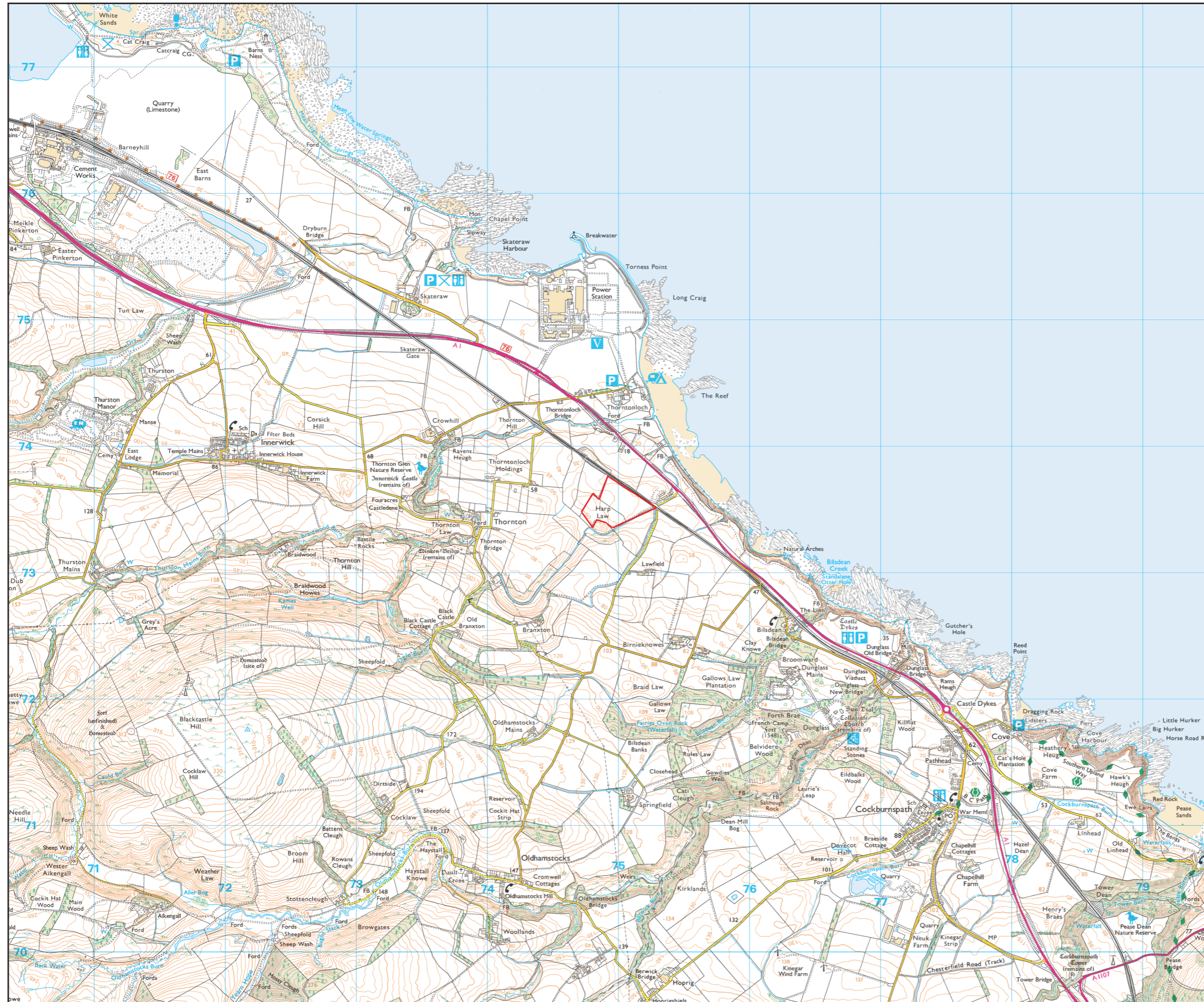
Figure 4 - Location Plan